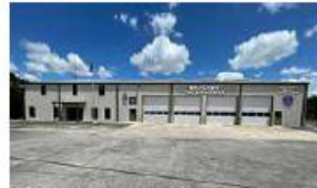
Central Station, 23600 FM 3009 San Antonio, TX 78266 Provided this 1999 constructed steel-framed building with a needed electrical and HVAC upgrade to meet current code, while also rearranging much of its space to better accommodate operations and crew living areas

The new substation had adequate operations and sleeping space but lacked any bays for equipment or apparatus. The addition of the new equipment bay building permits this substation to be operational 24/7 and is helping to improve response to parts of our service area.