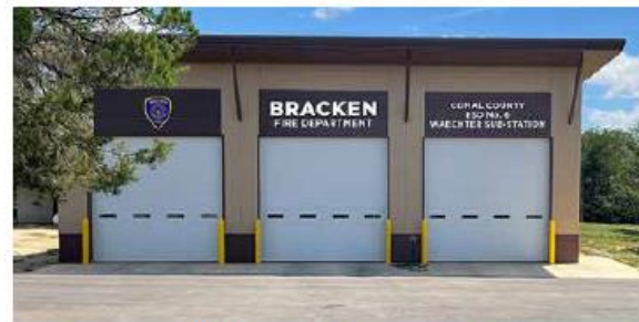
Waechter Substation, Corner of Hwy 1863 and Delafield Drive, New Braunfels, TX 78132 Added equipment-apparatus-bays, permitting 24/7 operations and is helping to improve service response